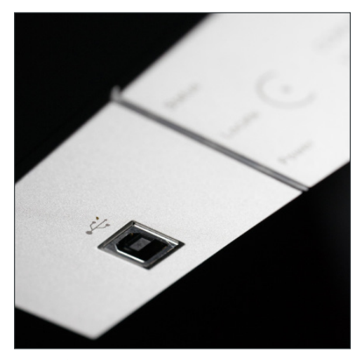
Everything you need Supports SIP, Dante®, 12 configurable mic/line

Supports SIP, Dante®, 12 configurable mic/line audio inputs, 8 configurable mic/line audio outputs, built-in USB audio, and a Telco interface for POTS calls.